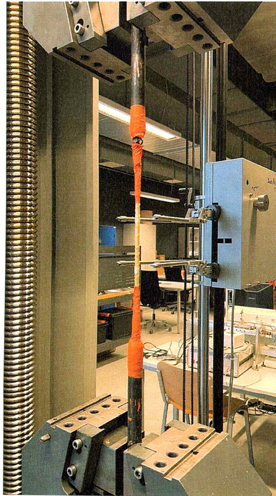
Fig. 1. ZWICK Z600 static testing system.