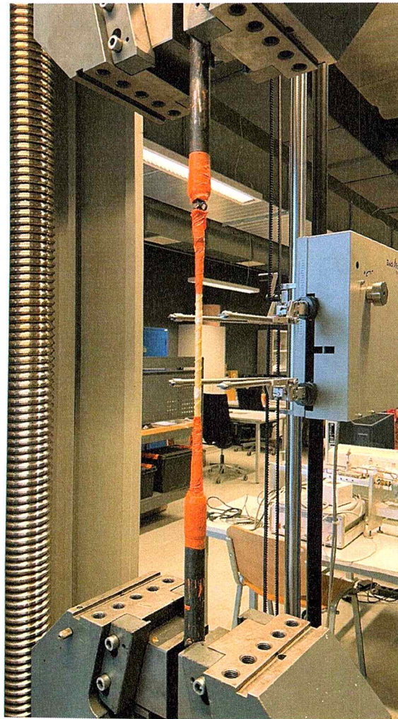
Fig. 1. ZWICK Z600 static testing system.